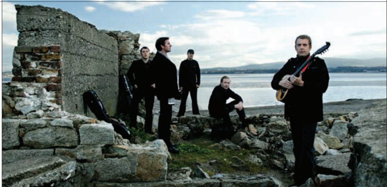
The Irish band Slide will be performing at Skye Theater South Carthage and Lakeside Theater in Rangeley March 11 and 12 respectively.