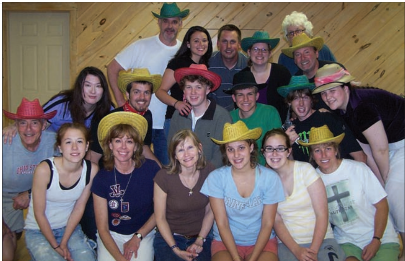
The cast of "Crazy for You," which will be performed July 4 to 7 at Lakeside Theater.

Send your A&E news and photos to theirregular@tds.net at least 2 weeks in advance. Thank You!