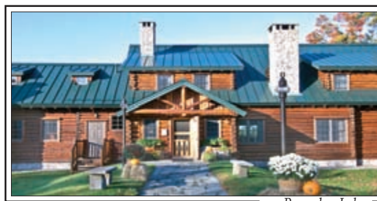
on Rangeley Lake

Dinner served Wednesday to Saturday 5-9 pm